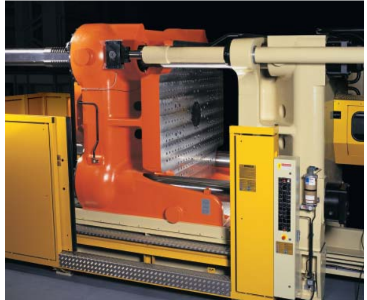
Injection Molding Machine with Trabon E-Series Pump