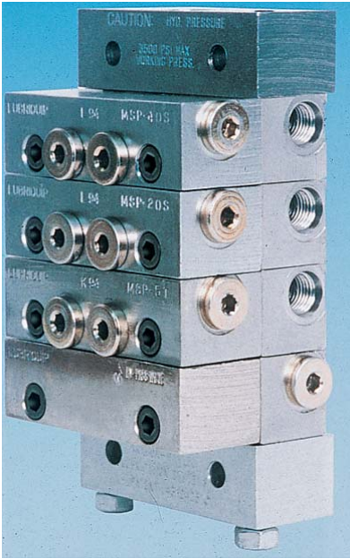
MSP Series Divider Valves

Trabon divider valves accurately distribute lubricant to multiple lube points. They are designed to accept a variety of accessories which facilitate troubleshooting and system control using electronic timers, counters and monitors.