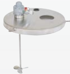
5 Gallon Pail Mount Agitator Part #: 243340

Wall mount (G15W05) and cart mount (G15C07) versions also available