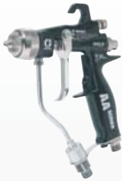
G15 AA Spray Gun Part #: 287926

Top coats and sealers are generally applied with medium pressure equipment due to the mil thickness required for a high quality finish. Air assisted equipment will deliver optimal flow rates while maximizing transfer efficiency and increasing productivity.