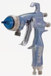
AirPro Spray Gun Part #: 288982

Adhesive applications vary in requirements from a bead of material to a full spray pattern. Low pressure equipment will assist in delivering the adhesive to the wood.