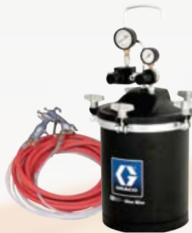
AirPro Pressure Tank Packages Part #: 24C828

Ergonomically designed for improved operator comfort