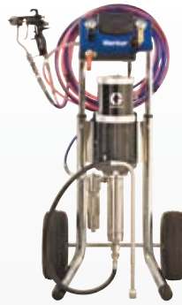
Merkur AA Spray Package Part #: G15C09

Lightweight and low trigger pull for improved operator comfort