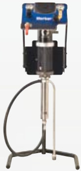
Merkur AA Spray Package Part #: G15T03

Wall mount version also available (G15W07)