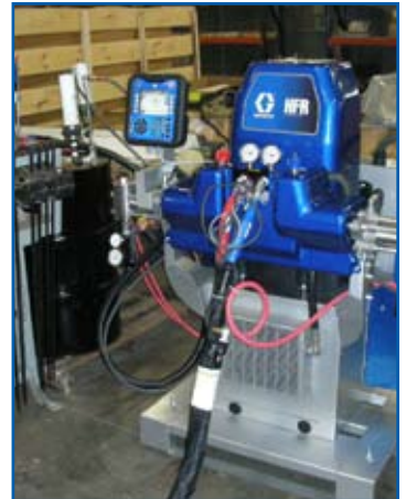
The Graco distributor, Foampack and Graco were able to provide newer technology at a lower price point.