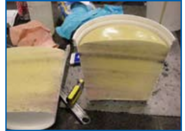
The gun and impingement mixing of the Graco HFR Metering System created perfect foam and cell structure with no voids or cracks.