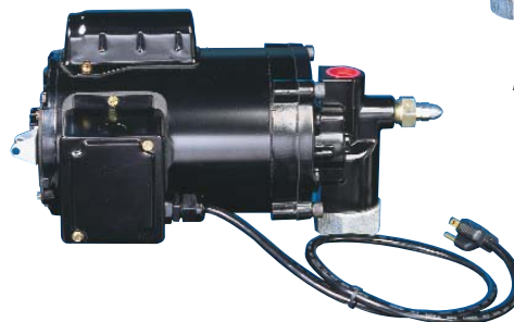
115 volt AC oil transfer pump