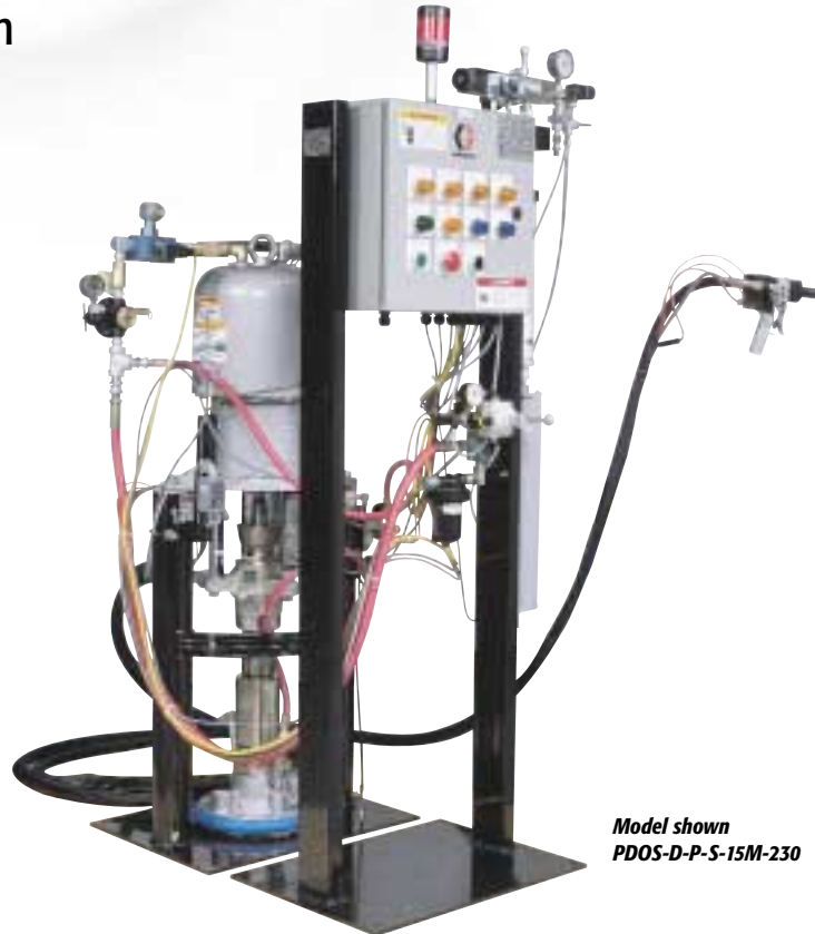
Model shown PDOS-D-P-S-15M-230

The most complete system for dispensing sealants that use booster paste to speed cure of structural sealants.